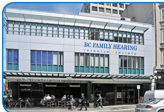
Victoria Satellite Centre

The same commitment to family-centred, choice-based, professional service exists at all of our facilities. Every family that is a client of BCFHRC can access the programs and services at our Main Surrey Centre at any time.