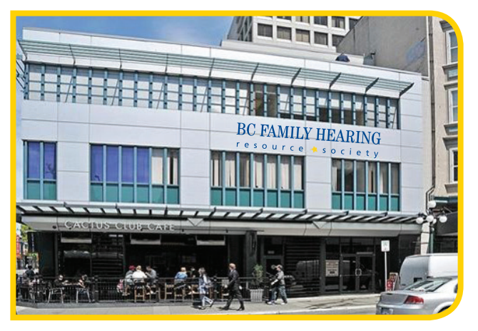
Vancouver Satellite Centre