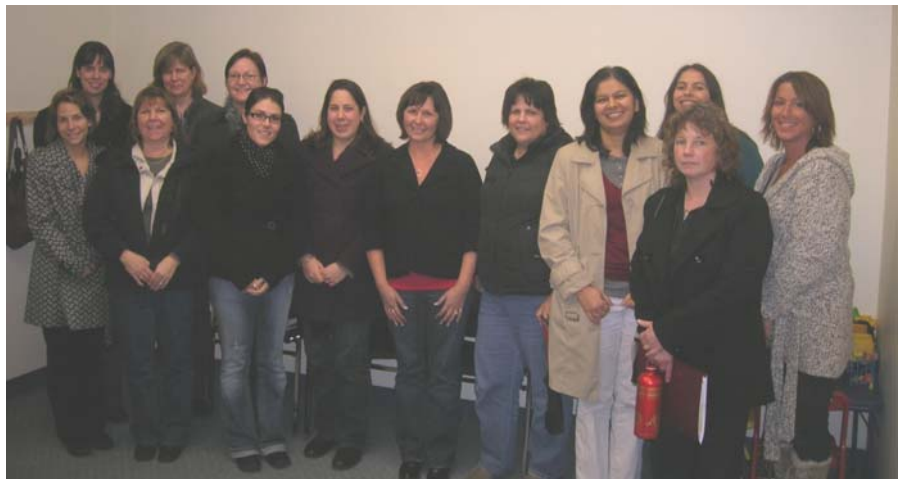
Partnerships Participants at the Mission Fraser Valley CDC

“The information on grieving was very helpful”